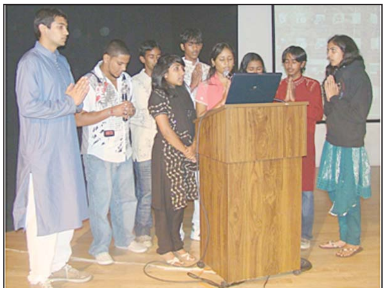
Youth singing Sanskrit prayers at WAVES Conference